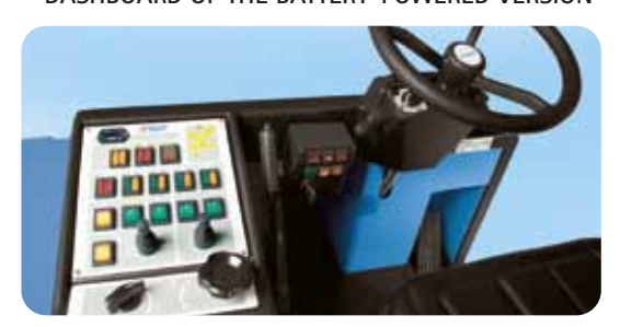
DASHBOARD OF THE DIESEL-POWERED VERSION

The driver's seat of Mg1300 has been designed to ensure maximum comfort. All controls are clearly laid on the dashboard