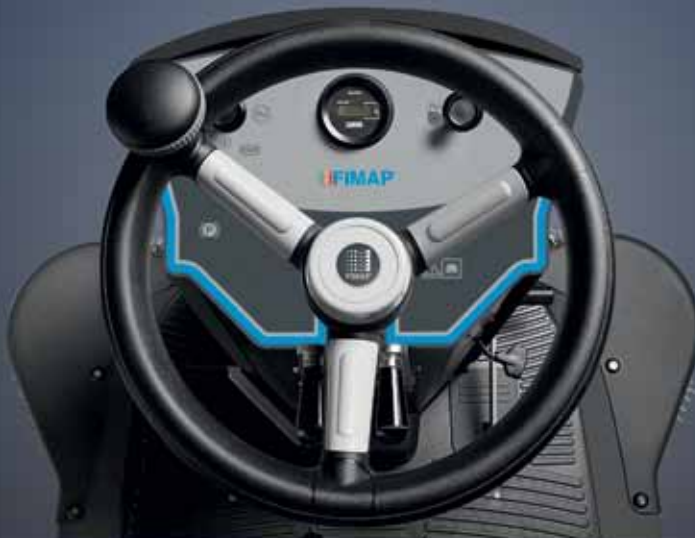
Instrument panel (Basic H version)

The brushes (central and side) are easily moved with the aid of 2 levers